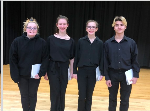
Reader's Theater- State Qualifier