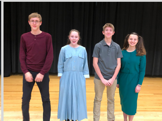
Freshmen Improv- State Qualifier