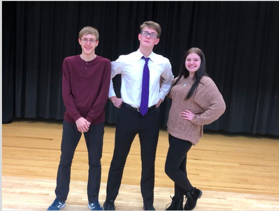
Choral Reading- State Qualifier

Six different groups performed in four different categories, including improvisation, choral reading, reader's theater, and one act play. Four groups qualified for state speech, which will be held on February 8, 2020 at Waukee High School.