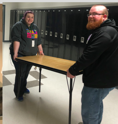
Friday Night Setup