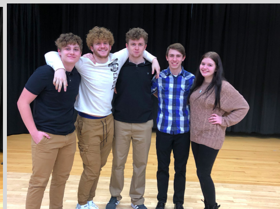
Improv- The Last of the Legiticans- State Qualifier