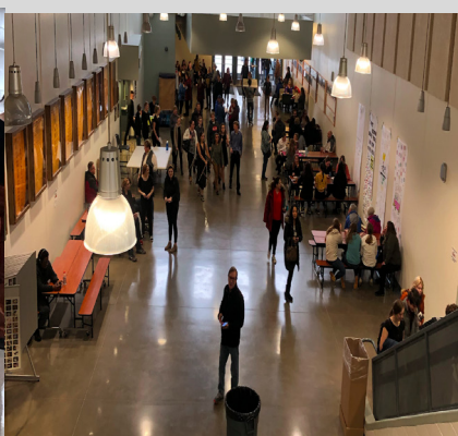
The Commons, before everyone came