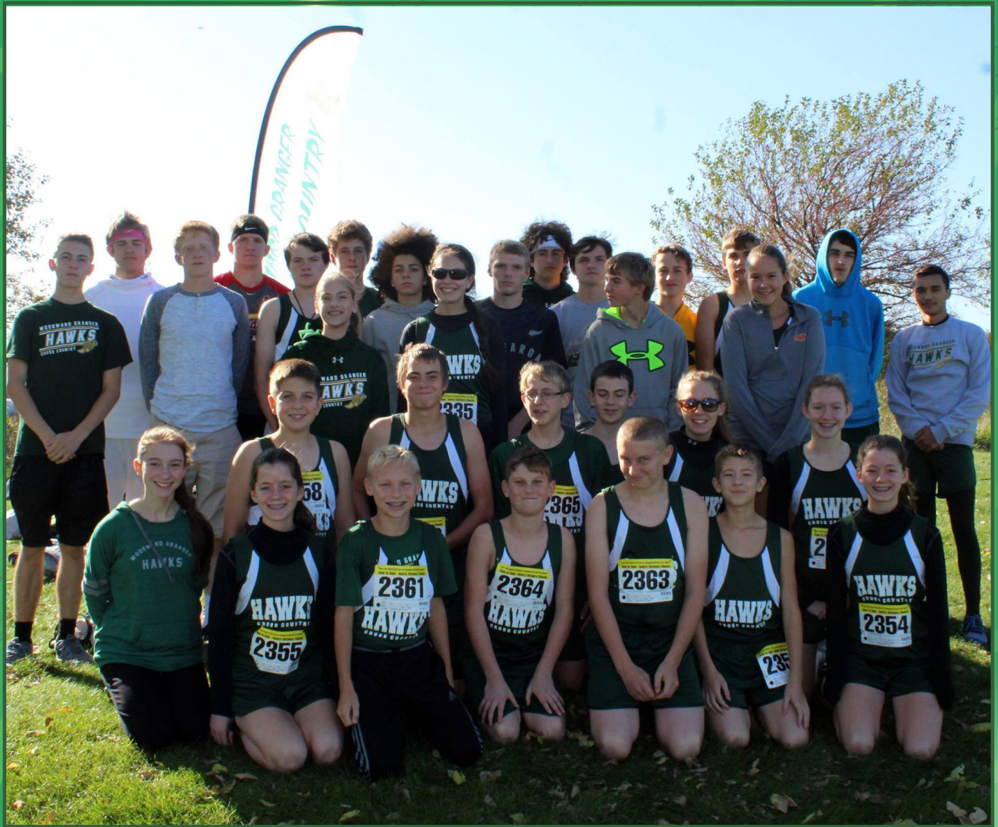
Cross Country Team